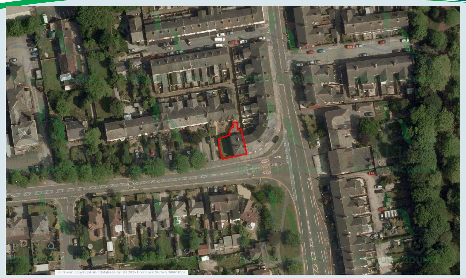
Application Number: 15/00395/FUL