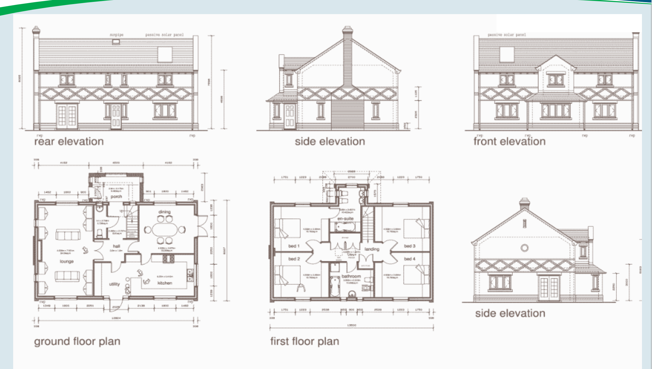
Application Number: 12/00100/OUT