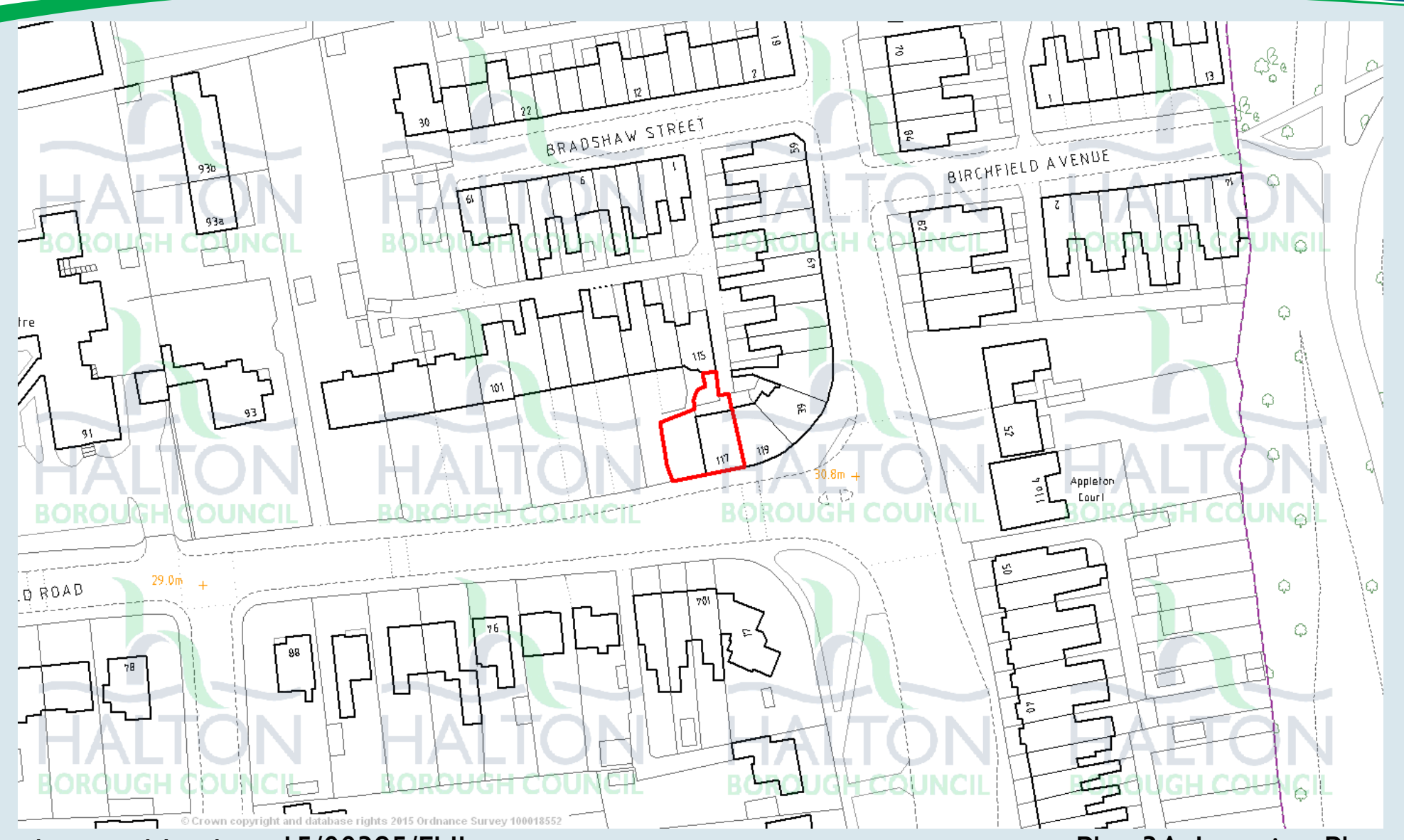
Application Number: 15/00395/FUL