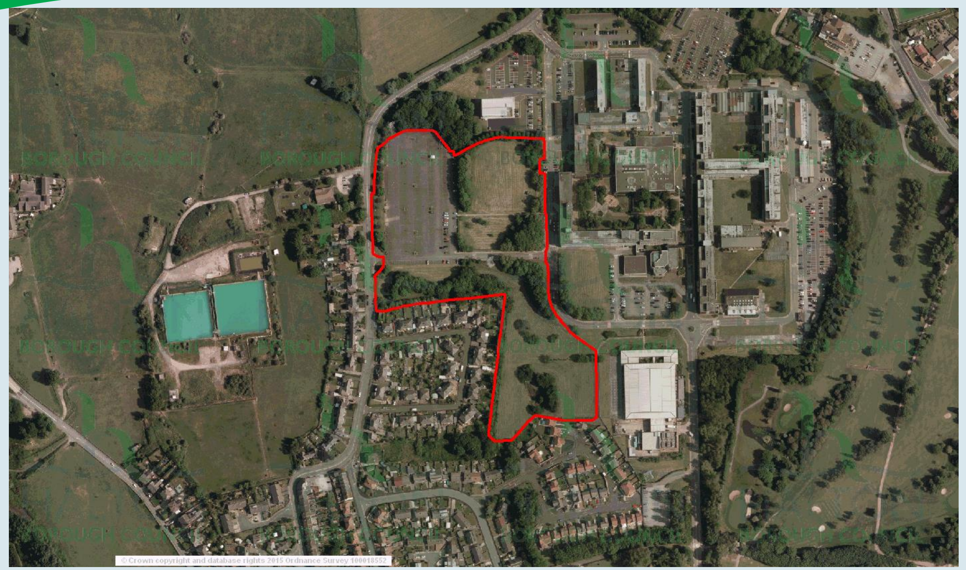
Application Number: 12/00100/OUT