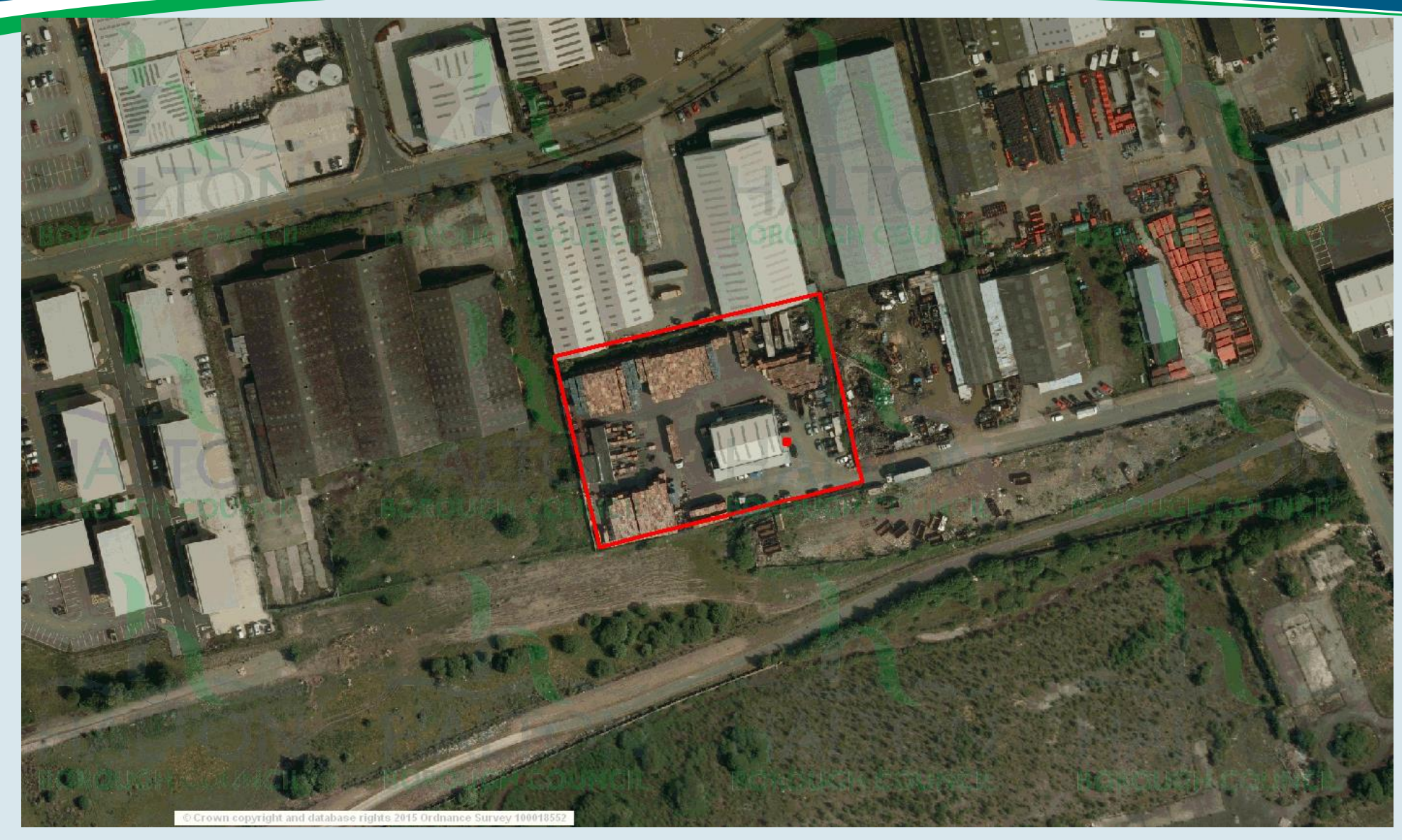
Application Number: 15/00014/OUT